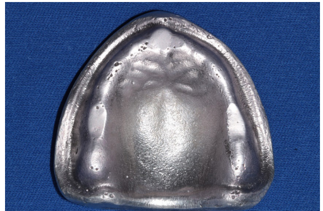
Figure 1- Metallic matrix used to make test pieces

to the manufacturer's indication. The tray was filled with alginate and it was carefully positioned on the metal matrix until the final setting time of the material.