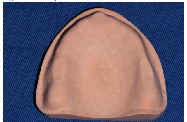
Figura 2 – Test especimens

The type IV gypsum was weighed in a digital scale (Actlife, Balmak, Santa Bárbara d'Oeste, SP, Brazil) and the water dosed in a 20mL syringe. The proportion and handling of the gypsums of each group followed the recommendations of manufacturer. The water and powder mixture was made by mechanical manipulation under vacuum (Polidental, Cotia, SP, Brazil) for 40 seconds. The plaster was cast on the alginate mold with a vibrator (VH Equipamentos Ltda, Araraquara, SP, Brazil). The models were desincluded from the mold after 40 minutes. The specimens were cut with the purpose of obtaining a straight base for greater stability during the tests of roughness and surface microhardness (Figure 2). They were divided into 4 groups (n = 10) according to the brand of gypsum used in their manufacture: G1- Dent-Mix 4 (Asfer Industria Quimica Ltda, São Caetano do Sul, SP, Brazil), G2- G4 (S.S White Dentures Ltda, Rio de Janeiro, RJ, BR), G3- Clone (VIPI, Pirassununga, SP, Brazil) and G4- Durone (Dentsply, Petrópolis, RJ, Brazil).