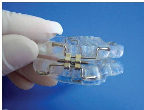
Figure 3: Mandibular advancement device: Placa Lateroprotrusiva-PLP® .

The plates have acrylic tracks that allow progressive advancement and laterality movement of the jaw, which are realized in a stable, solid, and interference-free path. Although such tracks have the purpose of guiding the movement, they have no function in relation to existing orthopedic devices (Figure 3).