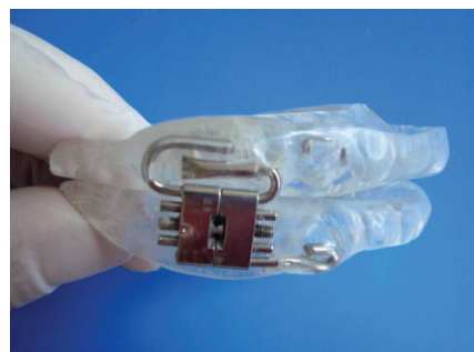
Figure 2: Mandibular advancement device: PM Positioner™ .

- PM Positioner™ 29 : The device has plates that fit over all upper and lower teeth. Expansion screws are located in the left and right mouth areas to allow maximum space for the tongue and favor the forward positioning of the jaw for maximum effectiveness. The clamps are placed internally to the plates for better retention of the device. Forty-four forward positions are available in increments of 0.25 mm, covering 11.0 mm range of anteroposterior movement 29 (Figure 2).