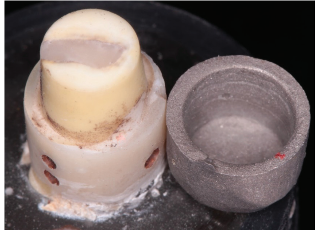
Figure 1 – Bovine tooth prepared with 90-degree terminal beside the metal crown

12 total metallic crowns cast in different titanium alloys on central incisors of bovine origin were performed. The teeth were kept in chemically activated acrylic resin (OrtoClass - Artigos Odontológicos Clássico Ltda. - Sao Paulo - SP, Brazil) in PVC tubes, prepared under refrigeration with the cervical terminal on a shoulder of 90°, width of 1.5 mm and angle of axial walls of 80° and 5 mm height. When there were pulp exposures, these were restored with composite resin (Prisma APH- Dentisply Ind. e Com. Ltda. - Petrópolis - RJ, Brazil). In order for the piece to always be in the same position, a notch was performed at the tooth cervical terminal and reproduced on the piece (Figure 1).