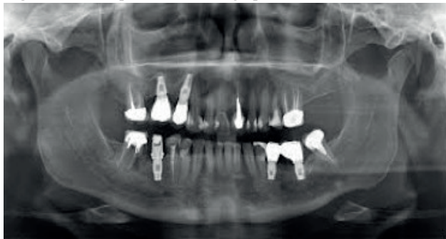
Figure 1- Initial panoramic radiograph