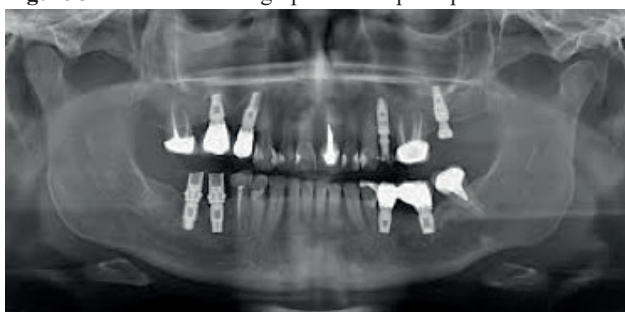
Figure 3. Panoramic radiograph after implant placement.

Due to the presence of such a delicate and wide (in diameter) vascular structure in the area subjected to the surgical procedure, a modified sinus lift technique was proposed avoiding alveolar antral artery and in a second time the implant placement, as shown in the panoramic radiograph (Figure 3).